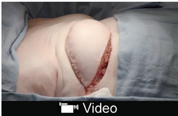
Video Graphic 1. See video, Supplemental Digital Content 1, which displays the all-in-one adjustable expander/implant technique. This video is available in the “Related Videos” section of PRSGlobalOpen.com or at http://links.lww.com/PRSGO/A631 .

The following associations were identified by logistic regression: adjuvant radiotherapy and capsular contracture ( P = 0.034 ), tumor size and deflation ( P = 0.014 ), and smoking history and infection ( P = 0.013 ). Of the 162 implants, 31 (19.1%) were replaced for the following reasons: extrusion (1 patient), capsular contracture (5 patients), and deflation (25 patients). Overall, 81% of breasts were successfully reconstructed using a single stage with the expander/implant approach.