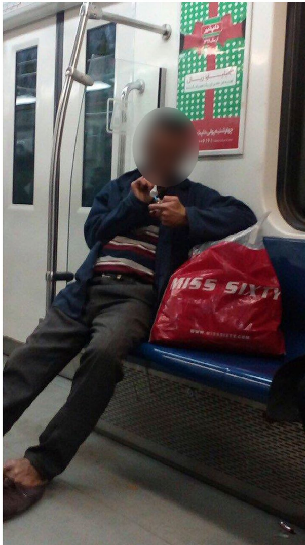
Figure 2. Meanwhile on the Tehran Metro: a shisheh smoker.

Note: This photograph circulated widely in September 2015 among Telegram App users. I received it in the drugs policy group (which includes leading members of the drugs policy community) 'The Challenges of Addiction'.