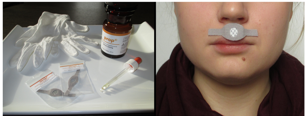
Fig. 1 Nocebo administration

two conditions (Nocebo, Control). Exploratory whole-brain voxel intensity tests were conducted as well as region of interest (ROI) analyses for the amygdala (number of voxels: left (L) 64, right (R) 75), the insula (L: 569, R: 527), the hippocampus (L: 283, R: 262), and the OFC (L: 1522, R: 1552). These regions were selected based on previous findings on disgust and nocebo effects (e.g., Schienle et al. 2002a, b, Wager and Atlas 2015). Additional ROIs involved in odor perception/ imagery were chosen (piriform cortex (L: 415, R: 467), entorhinal cortex (L: 81, R: 94)).