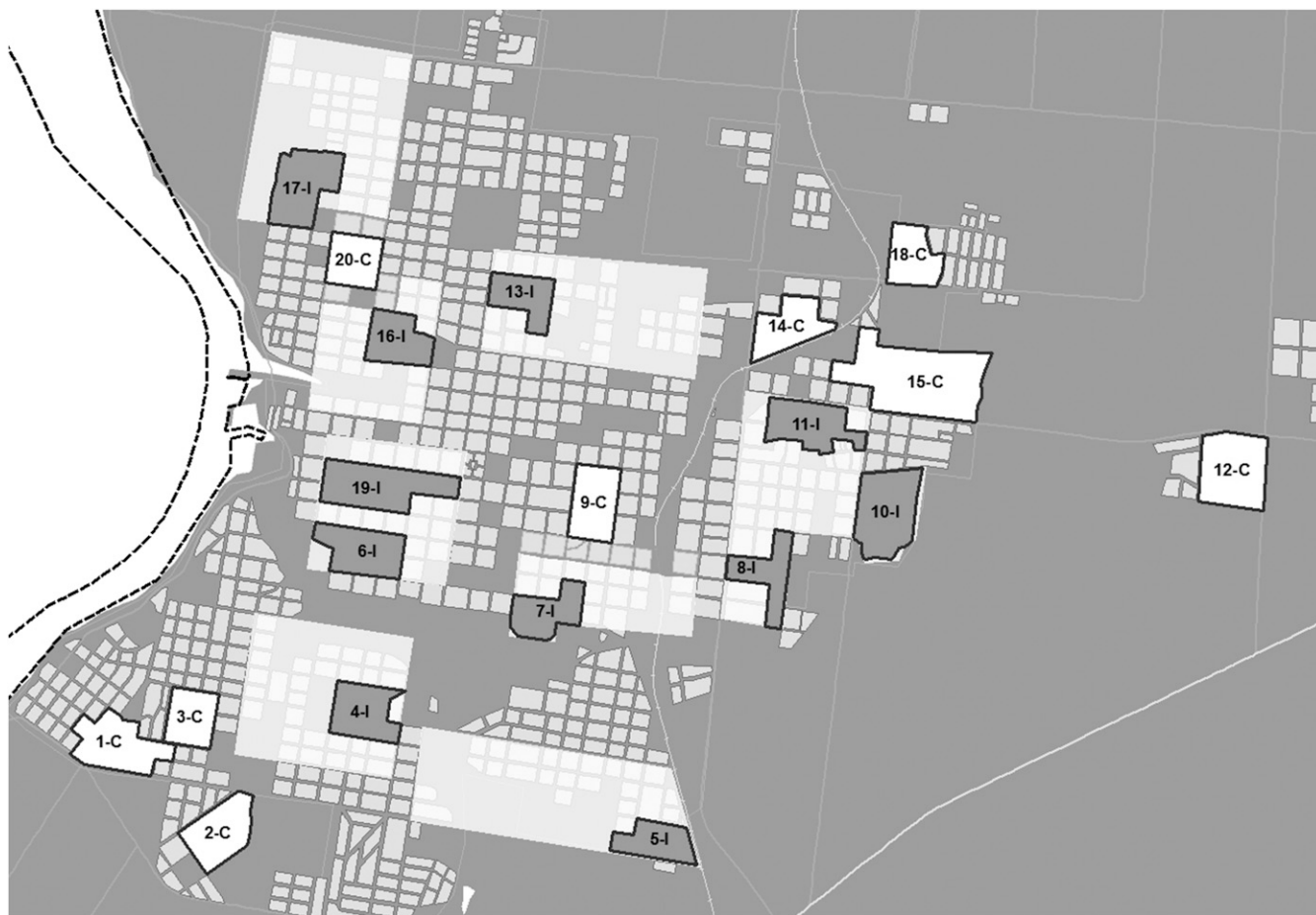
FIGURE 1. Eight areas of intervention in the city of Salto where the scaling up process was carried out. Eleven clusters (I) were included in those eight areas. Outside those areas, nine clusters were kept as controls (C).

promote mobilization of the population (according to principles formulated by Draper and others 35 ) were developed (meetings with teachers, parents, students, representatives of different community organizations, physicians...).