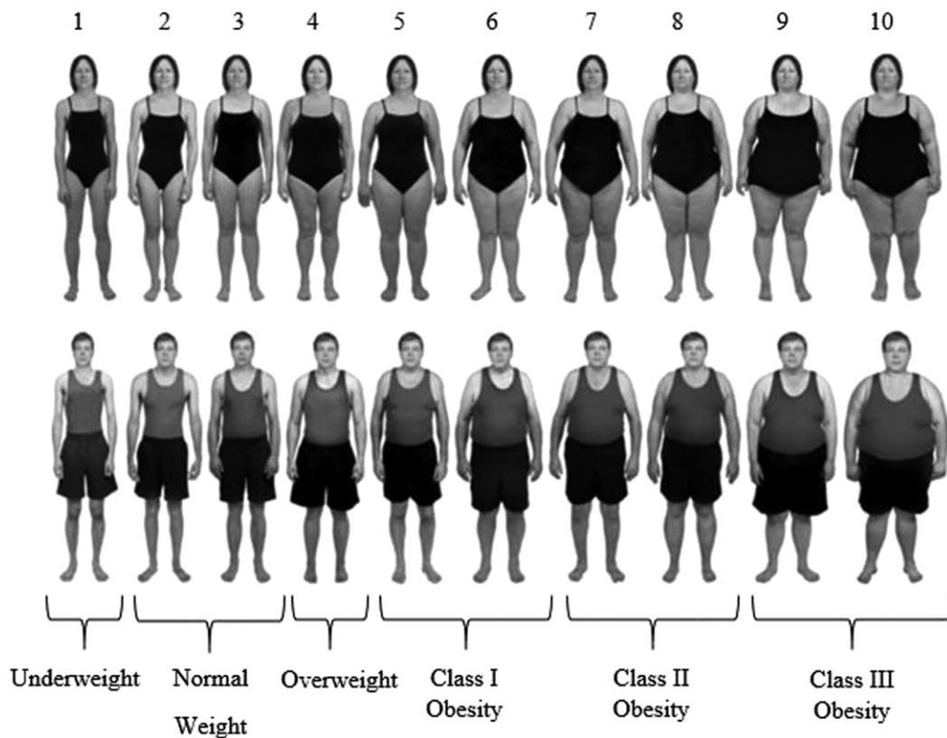
Figure 1 Female and male body size guide images (30) with rating scale (1–10) and weight status (according to objectively measured body mass index) below.

Stepwise regression analyses were planned to compare the different norm judgments in terms of the extent to which they predicted underestimation of weight status, as this regression model automatically selects the strongest predictors and removes non-significant predictors. To examine which norm measures best predicted underestimation of weight status for men and women separately, two stepwise regression analyses were planned with the upper and lower norm boundary, average and norm width as predictor variables and frequency of underestimation as the outcome variable. In order to examine whether a discrepancy in