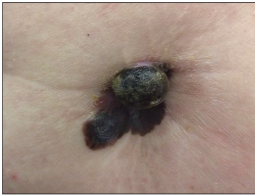
Figure 1: Nodular cutaneous melanoma, 5.6mm thick, enclosing the totality of umbilicus