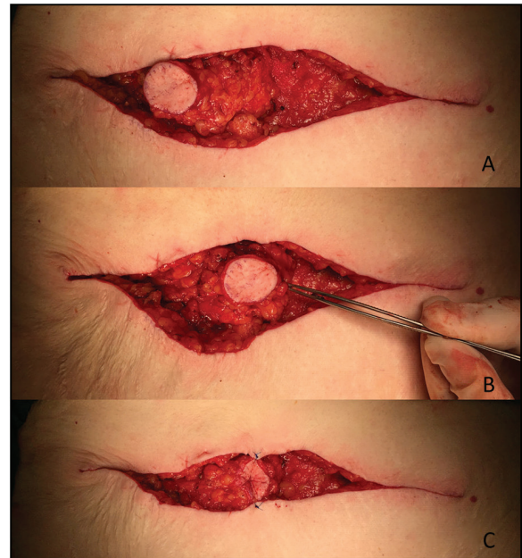
Figure 3: The island flap (A) was transferred to the desired position (B) and was fixed to the anterior sheath of the rectus abdominis muscle using a transfixive U stitch acquiring the intended conic shape (C).

This procedure was performed with the patient under general anesthesia. After performing wide excision with 2 cm margin of the melanoma, umbilical reconstruction and defect closure were planned [Figure 2]. Donor skin of the lateral margin of the defect was outlined to match the size and shape of the intended umbilicus. An island flap was designed such that the subcutaneous pedicle was long enough to be transferred to the planned site, setting the pivot point on the left lateral side of the flap. The island flap was successfully transferred to the desired position and was fixed to the anterior sheath of the rectus abdominis muscle using a transfixive U stitch at the center of the flap with a 2/0 absorbable suture (polyglactin 910). With this stitch, the flap acquired the intended conic shape recreating the umbilicus [Figure 3A-C]. The perimeter of the new umbilicus was sutured to the surrounding skin with 4/0 polypropylene. Meticulous placement of multiple subcutaneous sutures with 2.0 polyglactin 910 facilitated the approximation of the epidermis of the donor area without any tension. Epidermal approximation was obtained with surgical stainless steel staples [Figure 4A]. A pressure dressing was secured for 72h and then routine wound care advice was given to the patient. To prevent surgical site infection, the patient was given cefazolin 1000 mg ev before surgery and cefuroxime 500 mg bid po for 5 days