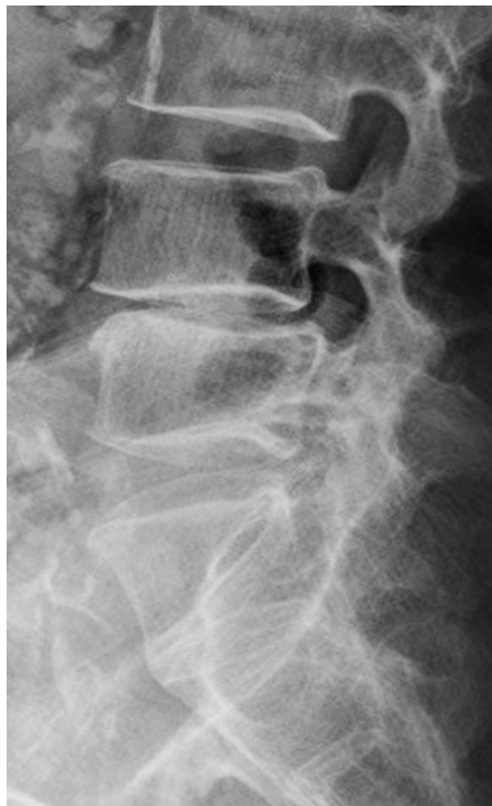
Fig. 2. Simple radiograph of a pear-shaped disc at the L4–L5 disc level. The disc with a convex surface in the posterior halves of the superior and inferior end plates and a concave surface in the anterior halves is shown.

Values are presented as number or mean±standard deviation.