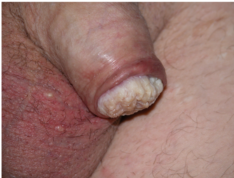
FIGURE 1. Macroscopic aspect. Squamous cell carcinoma of the glans penis, subsequently treated with partial penectomy.

The urological screening consisted of an annual sonography of the native and transplanted kidneys, bladder, and prostate; PSA measurement; urinalysis and urinary cytology. Microhematuria prompted urological investigation and physical examination revealed a fungating lesion of the glans [Fig. 1].