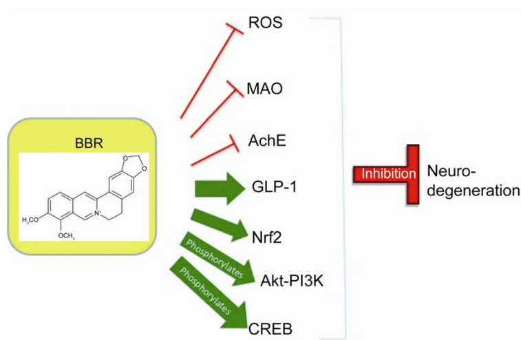
Figure 2. BBR interacts with many pathways that are affiliated with neurodegeneration or neuroprotection.