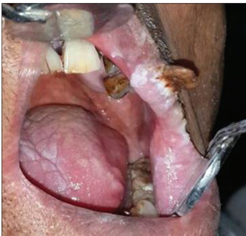
Figure 1: Clinical presentation of cutaneous horn on upper lip vermilion

The histological sections revealed hyperkeratotic stratified squamous epithelium with underlying connective tissue. The epithelium exhibited acanthosis, spongiosis, hyperkeratosis and broad rete pegs with pushing margins along with parakeratinized keratin plugging. The