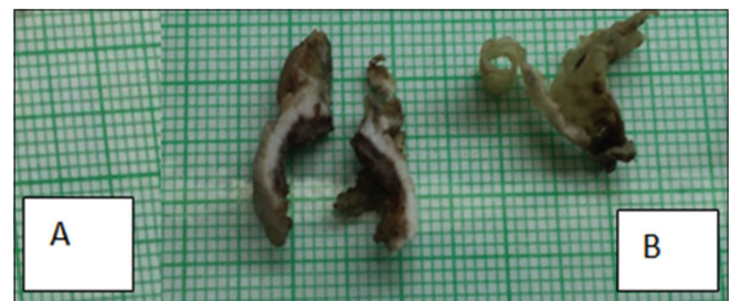
Figure 2: Gross specimen A. Cutaneous horn with base - cut surface B. Excised tissue from adjacent area

Cutaneous horn is a clinical diagnosis and includes various benign and malignant lesions at its base. [2] Lesions associated with cutaneous horn include keratosis, sebaceous molluscum, verruca, trichilemma, Bowen's disease, epidermoid carcinoma, malignant melanoma and basal cell carcinoma. [5] Cutaneous horn is most commonly encountered in Caucasians. It is relatively rare in Asians and even rarer in Africans. The possible explanation for this racial predilection may be the presence of more amount melanin pigmentation in the skin of Asians and Africans, which performs a protective role against ultraviolet rays-induced damage to epidermal cells. Long-term sun exposure and immunodeficiency have also been implicated in causation of this lesion. [4]