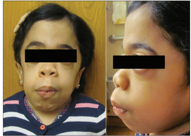
FIGURE 2. (A and B) A 15-year-old girl with mucopolysaccharidosis Type VI. Despite the fact that her facial characteristics gave impression that her airway is “manageable,” she had difficult mask ventilation, and 3 failed attempts to place a laryngeal mask airway. Placement of endotracheal tube was successful with a video laryngoscope aided by fiberoptic bronchoscope (see discussion for details). Published with the consent of patient’s legal representative.

Besides various airway issues, patients with MPS have other comorbidities that may have an impact on ventilation. Specifically, they frequently have restrictive or obstructive lung disease, recurrent lung infections, and obstructive sleep apnea [5]. Propensities for bronchospasm and oxyhemoglobin desaturation may complicate