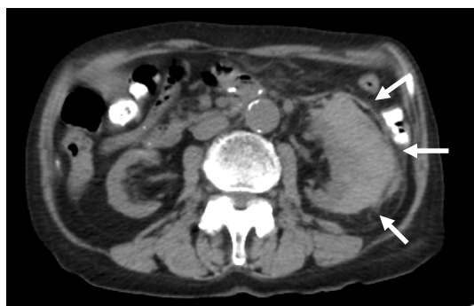
Figure 1. Computed tomography revealed a subcapsular renal hematoma.