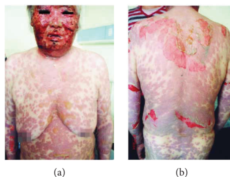
FIGURE 2: Typical cases of TEN from Chinese literature [12]. (a) Widespread reddish to purplish macules and bullae on the trunk and upper limbs, with erosions on swollen face. (b) Macules and large skin detachment on the lateral trunk and upper limbs.

166 met the criteria of probable to definite cases of SJS/TEN, including 94 cases from literatures and 72 cases from the hospital (incidence rate of hospital population was 1.8%). Among them, there were 70 (42.2%) as SJS, 2 (1.2%) as SJS-TEN, and 94 (56.6%) as TEN. Typical cases of SJS and TEN from Chinese literature were shown in Figures 1 and 2.