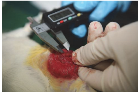
FIGURE 1: Measurement of explant volumes (length, width, and height) using digital millimetric caliper at second and third laparotomies.

concentrated by heating. The final drug concentration was 1 g/mL.