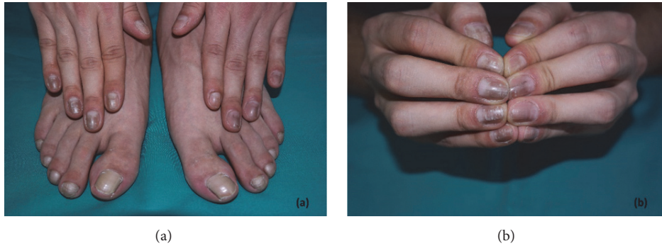
FIGURE 1: Whole fingernails and toenails of our patient. Normal toenails except for the second ones which have transverse lamellar splitting (a) and grayish pigmented bands with varying widths and intensities on fingernails, predominantly on right hand; loss of cuticle and erythema of proximal nail folds which can also be seen on both hands (b).