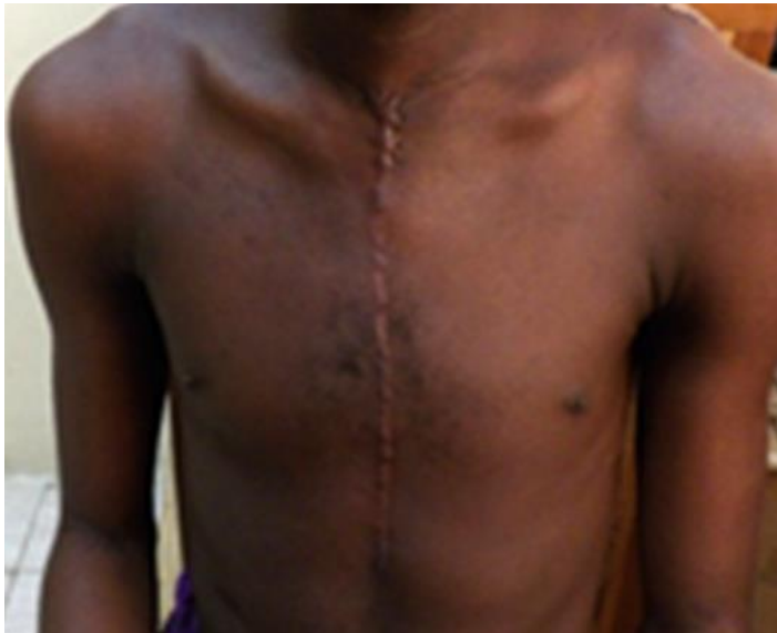
Figure 3: Sternotomy scar