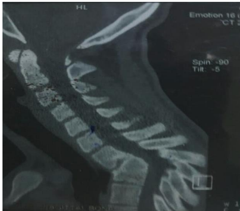
Figure 1: Preoperative CT Imaging with spinal cord compression at level T1/T2