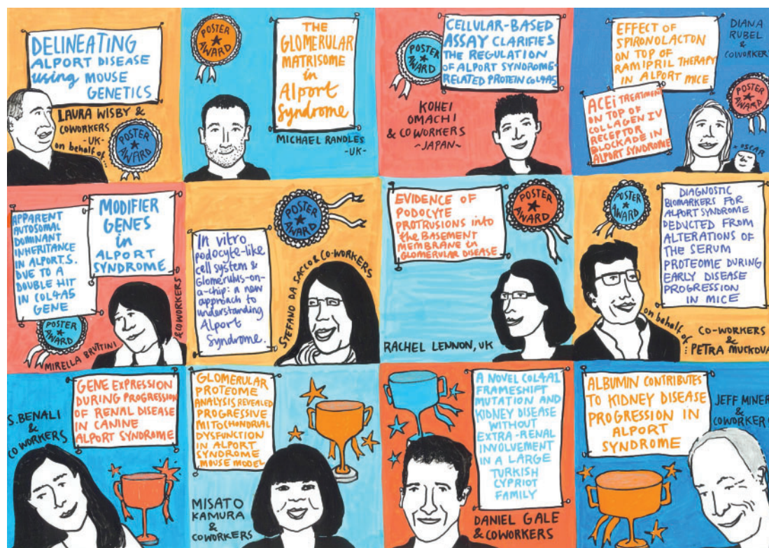
FIGURE 2: Poster prizes and young investigator awards of the 2015 International Workshop on Alport Syndrome.