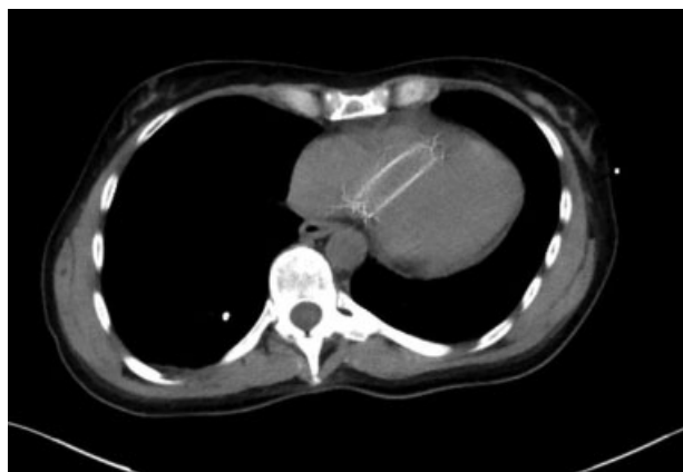
Fig. 1 Chest computer tomography with the venous stent dangling in the tricuspid valve apparatus.