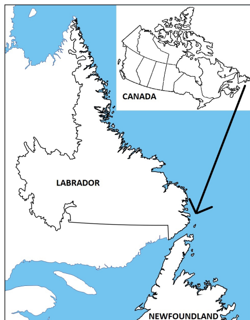
Figure 1 Map of Newfoundland and Labrador.

The data from other ecological studies suggest that the incidence rate of type 1 diabetes is significantly lower when the concentrations of zinc and magnesium in the domestic drinking water are in the range 22.27–27.00 mg/L (incidence rate ratio (IRR) 0.76; 95% CI 0.59 to 0.97) and >2.61 mg/L (IRR 0.72; 95% CI 0.58 to 0.91). 12–14 It has been also suggested that zinc, magnesium, calcium, chromium and to some extent copper, have a protective effect against developing type 1 diabetes. 11 12 15 16 Zinc is involved in cellular antioxidative defense and mostly found in the secretory vesicles of \beta -cells in the pancreatic islets. Magnesium is an essential cofactor helping insulin to bind to the insulin receptor. Therefore, lower serum zinc and magnesium are significantly associated with type 1 diabetes. 17 While all of these studies point to a possible connection to various elements found in water, the impact of water quality on the incidence of type 1 diabetes is still inconclusive. 18