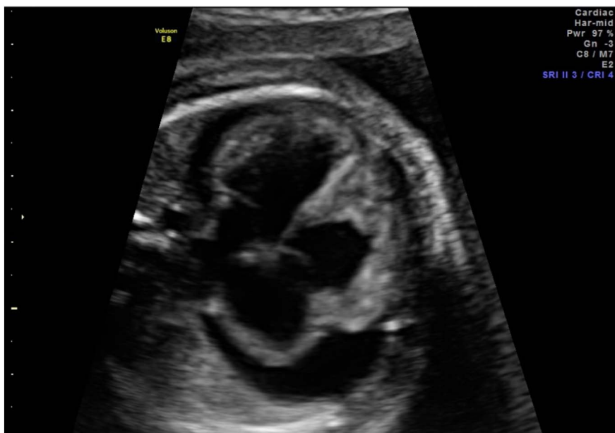
Fig. 2. Pericardial effusion prior to first PUBS procedure.

and negative antibody screen. The patient denied any sick contacts. Maternal Parvovirus B19 IgG and IgM were found to be negative at presentation. Further infectious evaluation was deferred due to the patient's uninsured status.