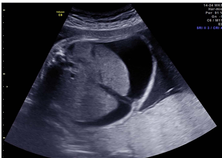
Fig. 1. Abdominal ascites prior to first PUBS procedure.