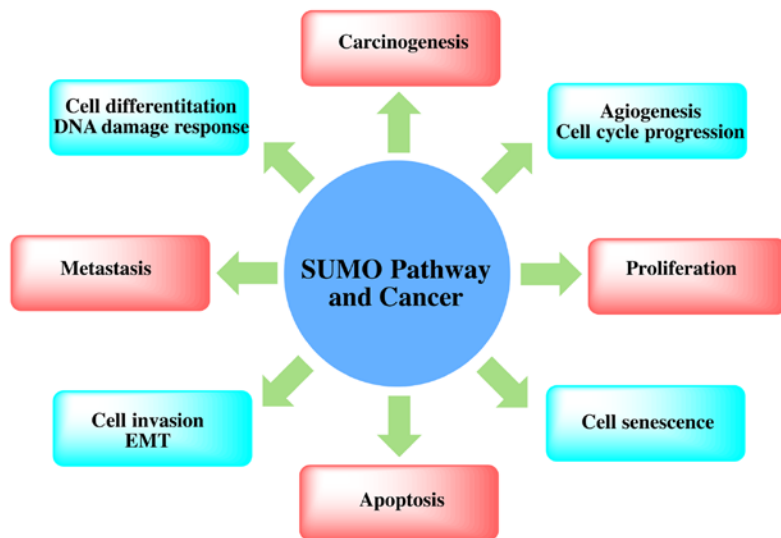
Figure 2. Association of the SUMO pathway and cancer. SUMOylation has an impact on cancer cell signaling and gene networks that regulate inflammation, immunity and DNA damage, which provides link with carcinogenesis, proliferation, metastasis and apoptosis.