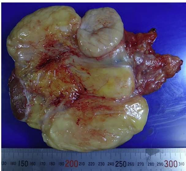
Fig. 2. Macroscopic findings of the left inguinal and scrotum tumor resection.

epididymal cyst, or testicular tumors. 1 If there are any little suspicions about the diagnosis, we should prompt imaging studies. 1 CT is more useful for the diagnosis of liposarcoma than ultrasound examination. 1 MRI provides good information for the precise localization of the tumor, but it cannot provide the complete type of the