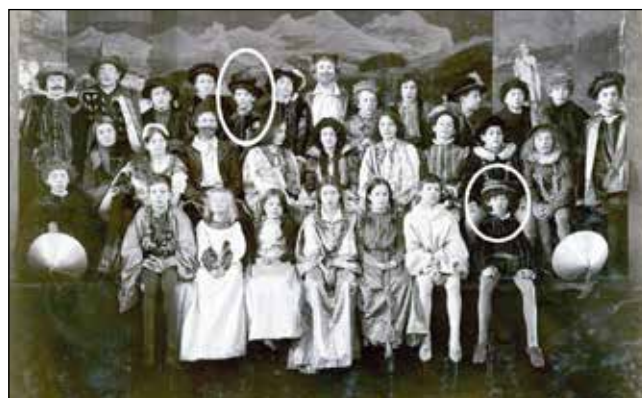
Fig 1. Twelfth Night , Oxford Preparatory School, 1909.