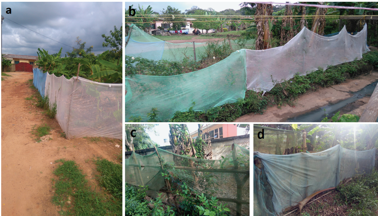
Fig. 2. Pictures showing the practice of using old insecticide-treated nets to fence backyard gardens in some urban residential areas in Ghana (a and b: Cape Coast, c and d: Akim Oda). Each of the fences is made up of a different brand of nets having different insecticides and different manufacturing dates.

Previous studies in Ghana have found insecticide contamination in soil, drinking water, surface water, fishes, and mosquito-breeding habitats (Achonduh et al. 2008, Essumang 2015, Gbeddy et al. 2015, Fosu-Mensah et al. 2016). However all of them were associated with agricultural activities or large water bodies that receive runoff from several sources including agricultural areas. With regard to mosquitoes, Achonduh et al. (2008) detected cypermethrin and