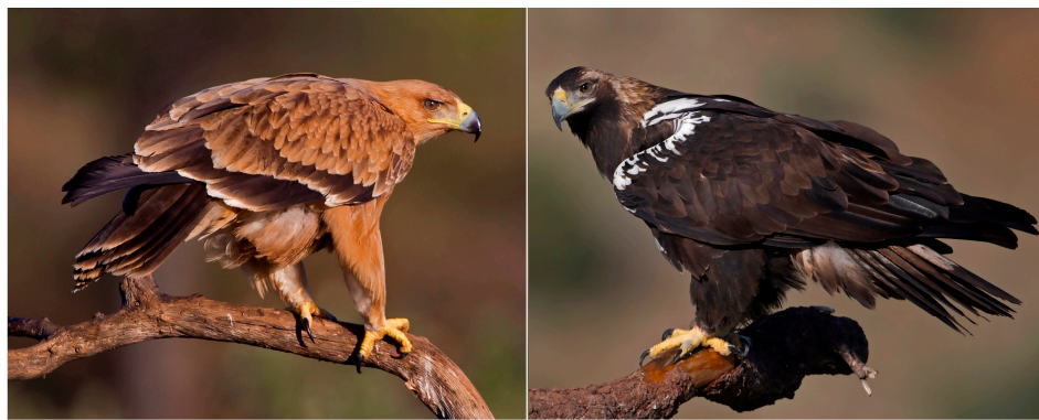
Figure 1. Spanish Imperial Eagles Aquila adalberti . On the left, a juvenile individual showing a light-colored plumage mainly based on the presence of pheomelanin. On the right, an individual showing the much darker full adult plumage (with white “shoulders”), based on eumelanin. This eagle species presents delayed plumage maturation, and the adult plumage is typically attained when individuals are 4 years old.

The Spanish Imperial Eagle Aquila adalberti sports a full light-orange plumage coloration in juveniles whereas the adult birds are almost fully black (Figure 1). The same intraspecific variation can be found in mammals, for instance with the black-and-gold howler monkey Alouatta caraya . The adult male is pitch black, whereas adult females and juveniles are gold-colored. Were the single and only Psittacosaurus studied in [9], and the one Borealopelta specimen studied in [10], members of a monochromatic, dichromatic, or polychromatic species? With a sample size equal to one, this is impossible to assert. Curiously enough, Psittacosaurus is one of the few dinosaur genera for which a lifetime growth curve has been built based on fossil bone structures, and it has been proposed that they grew for several years before reaching the larger size [43]. For this curve to be generated, numerous specimens from the same paleontological site were used. Ideally, and following this example, paleoscientists should aim to describe integumentary coloration in a set of different individuals of different age classes and the two sexes, to determine whether the species under investigation showed intraspecific color variation.