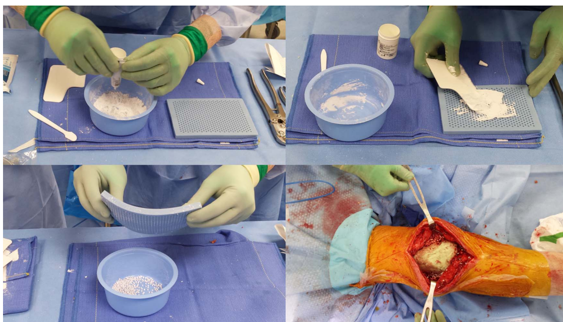
Fig. 3. Calcium sulphate antibiotic-impregnated beads are prepared mixing a 10-ml kit of PG-CSH with 1000 mg vancomycin hydrochloride powder plus 6 ml of a 40-mg/ml tobramycin solution.

Most recently, Chen et al. 33 demonstrated good results using a protocol of aggressive surgical debridement, local antibiotic-loaded cement beads, combined parenteral and oral antibiotic therapy and re-implantation after normalization of ESR and CRP levels.: forty-six out of