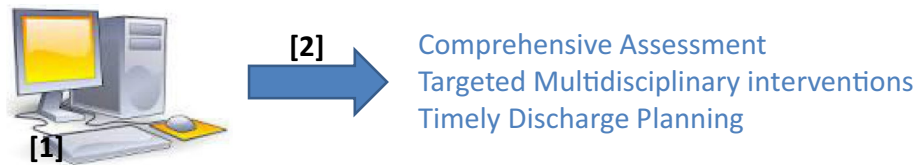
Fig. 2 Main components of Salford-POP-GS Surgical In-reach Team. (1) Proactive, daily case finding via electronic patient records of patients over 74 years of age. (2) Multidisciplinary Team work