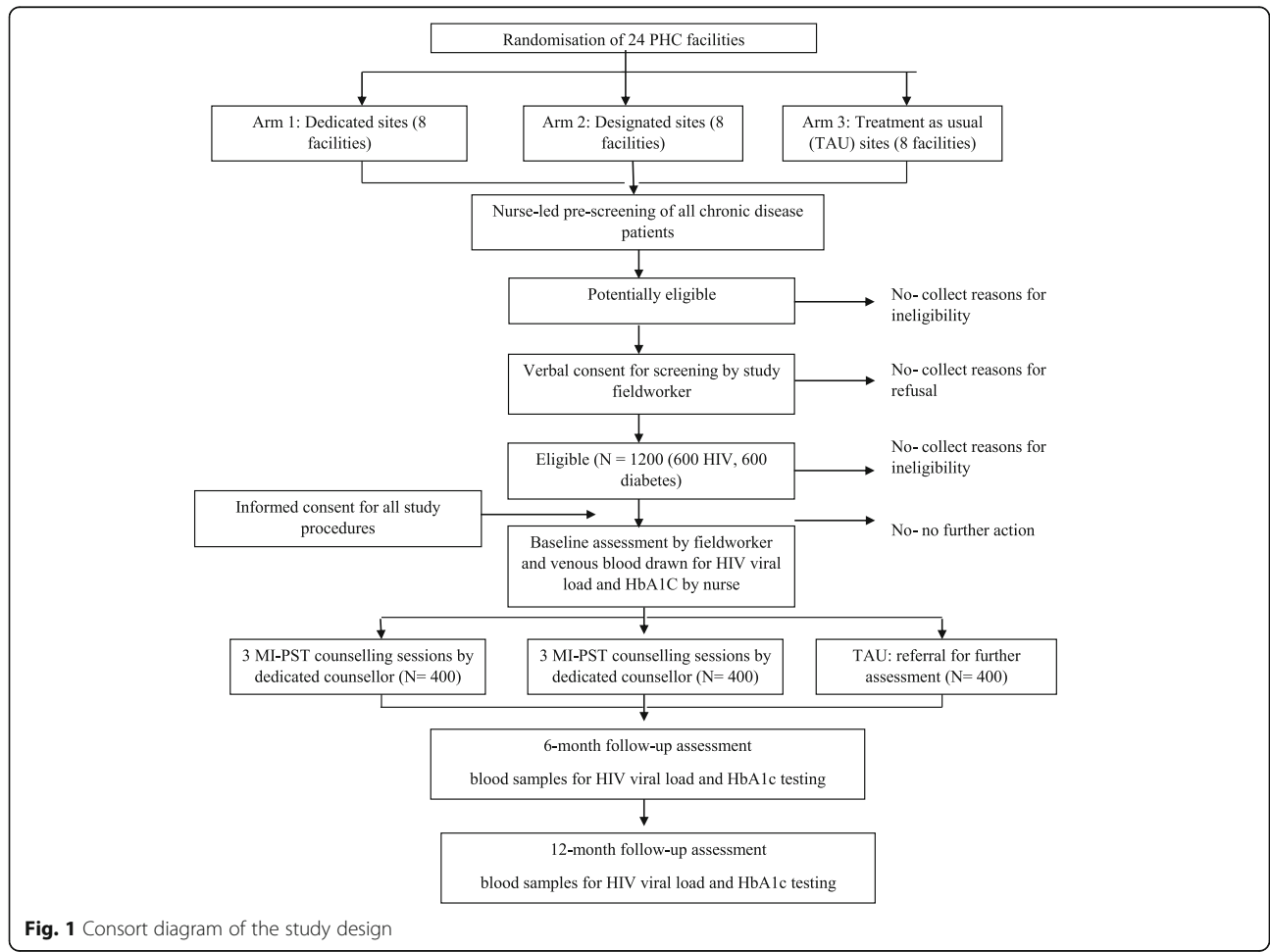
Fig. 1 Consort diagram of the study design

The trial will be conducted at 24 co-located HIV and diabetes treatment clinics in the Western Cape. For these clinics to be included in the trial, they needed to treat large enough numbers of patients to facilitate patient recruitment and be co-located within PHC facilities. For the most part, HIV and diabetes services are provided by separate, vertically organised clinics co-located within the same PHC facility; this study requirement therefore is unlikely to introduce a selection bias. The WCDOH purposively selected PHC facilities to participate in the trial. Selected facilities vary in size and the extent to which comprehensive health services are provided in order to be broadly