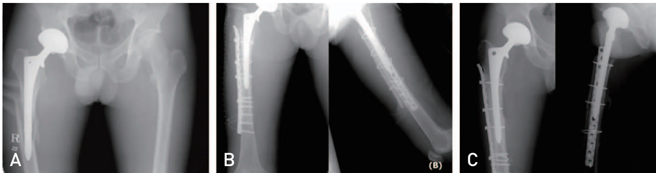
Fig. 2. A 43-year-old male patient suffering from a periprosthetic fracture resulting from a fall underwent open reduction, internal fixation and cortical strut allograft. (A) Preoperative X-ray reveals a Vancouver type B1 fracture. (B) Anterior posterior and axial views of the femur following open reduction, internal fixation and cortical strut allograft. (C) One-year postoperative X-ray showing complete incorporation.