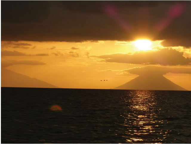
Figure 3. A view of Ometepe Island with its twin volcanoes illustrates the proximity of a major fault line to the canal route.

to 190 camera-trap days) and detected less than 50% of the known species for the region (Jordan and Urquhart 2013, Jordan 2015). The mitigation measures suggested by ERM are unlikely to be useful for rebuilding forests or preventing substantial biodiversity loss.