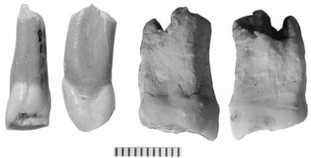
Fig. 2. Middle Pleistocene human dental remains from the Bau de l'Aubesier. From left to right: Aubesier 4 I 2 lingual, Aubesier 4 I 2 distal, Aubesier 10 M 1-2 mesial, Aubesier 10 M 1-2 distal. Scale in mm.

The results of the two models for the six samples give an average minimum age estimate of 169 \pm 17 thousand years (ka) and an average maximum one of 191 \pm 15 ka for layer H-1. Using the 2\text{-}\sigma range of these age estimates, the flint samples were heated either in OIS 6 or 7. The biostratigraphic indicators for layer H-1 are somewhat younger than these results. The human remains from layer I2, I-3, and K-1 derive from slightly deeper in the stratigraphic sequence than later H-1, and they therefore date to the later Middle Pleistocene.