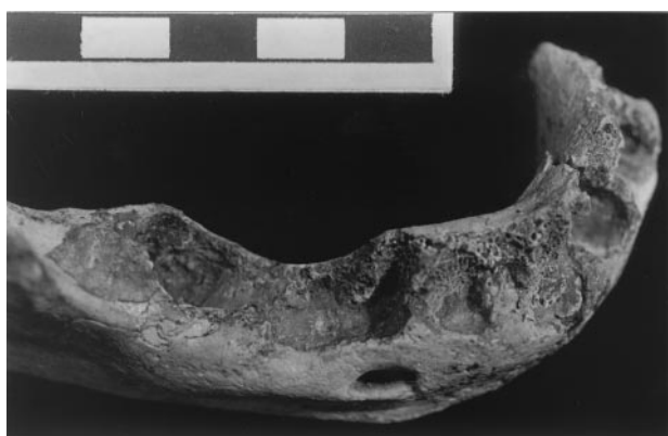
Fig. 5. Aubesier 11 mandibular alveolar arcade showing alveolar resorption, anterior apical abscesses, antemortem loss of the M_2 , and worn root apices of the C_1 and P_3 . Scale in cm.

The Aubesier 4 I^2 (13) is notable for its labial bi-convexity and pronounced shoveling. The crown exhibits strongly marked marginal ridges corresponding to grade 6 shoveling of the Arizona State University Dental Anthropology System (ASUDAS) scale (16). These ridges meet lingually at an ASUDAS grade 5 tuberculum dentale. Labially, the tooth is