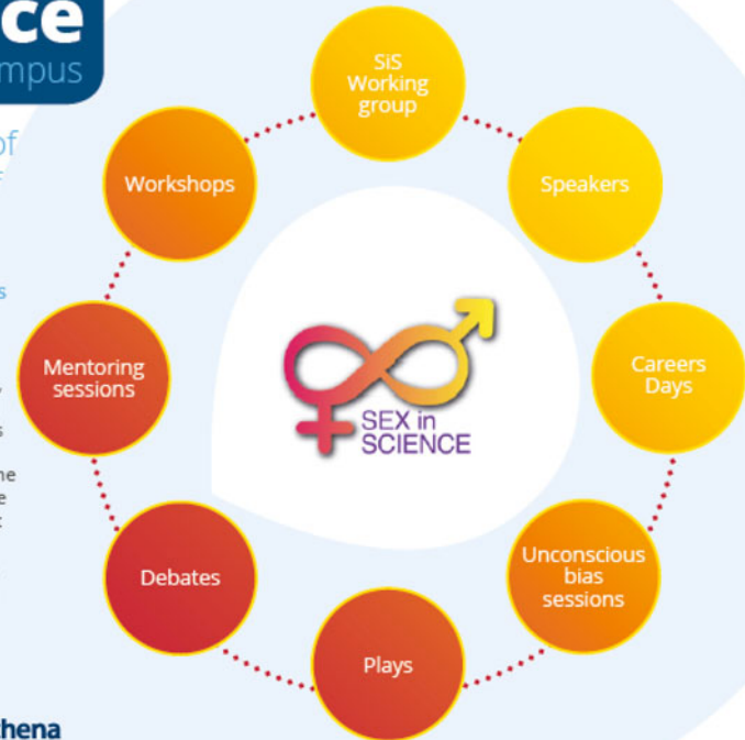
Fig. 1. Athena SWAN and SIS information included in the induction pack (front page).