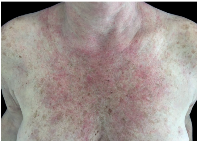
FIGURE 3: Shawl sign