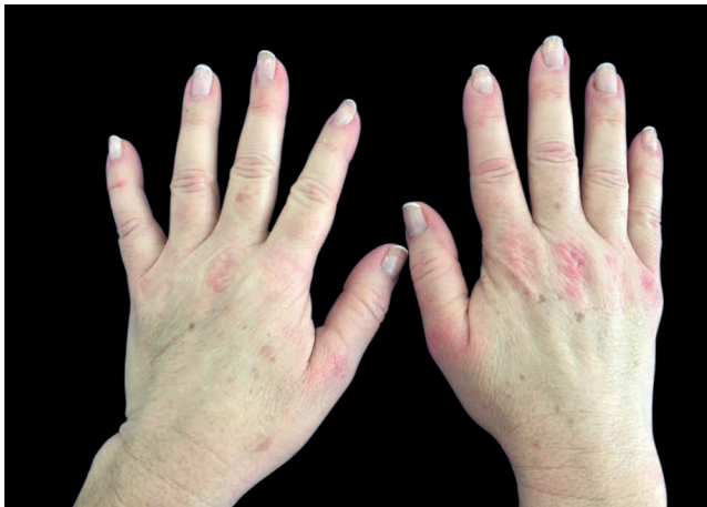
FIGURE 2: Gottron's papules observed on the hands