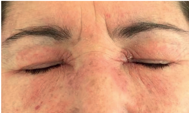
FIGURE 1: Heliotrope rash

One year after the patient's first symptoms, indurated, painful, violaceous, erythematous, subcutaneous nodules appeared on the upper limbs, thighs, back, breasts, gluteal region and abdomen (Figure 4). Skin biopsy of the left inner thigh revealed lymphocytic panniculitis with plasma cells of a lobular pattern and vasculopathy (vascular endothelial hyperplasia and edema) (Figure 5). After the onset of panniculitis, we increased the dosage of prednisone and introduced chlorambucil, which was suspended two months later given the deterioration of the inflammatory condition. Thus, we decided for a new pulse of methylprednisolone and maintained the doses of prednisone. One month later, an increase of the panniculitis lesions was noticed and the patient began treatment with methotrexate for five months. From then on, despite the presence of active lesions, the patient suspended the drug on her own. The patient was once again treated with chlorambucil combined with prednisone 1mg/kg/day. One year after the onset of panniculitis, her skin manifestations remained unresponsive to treatment, but she continued showing no sign of muscle disease.