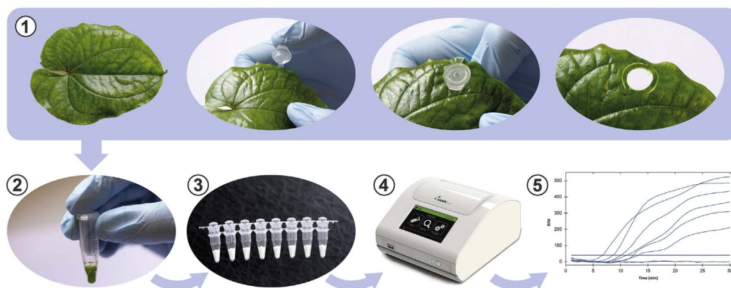
Fig. 1. Direct RT-RPA detection method workflow showing sample processing and assay setup steps. 1 - punch leaf with lid of 1.5 mL tubes; 2 - immerse leaf disk in alkaline-PEG buffer and incubate at room temperature for < 5 min; 3 - resuspend lyophilised pellet; 4 - read fluorescence; 5 - analyse results: an increase in fluorescence above threshold indicates a positive reaction.

temperature for < 5 min (Fig. 1) making sure leaf disks were soaked in the buffer. Plant extracts were tested immediately or kept on ice until further use.