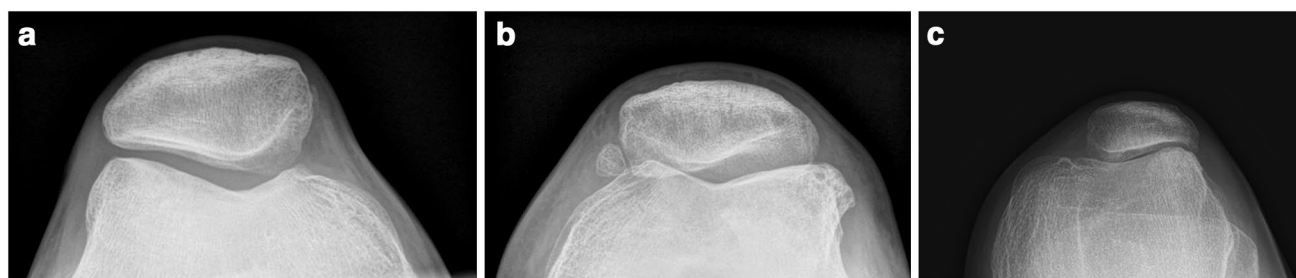
Fig. 2 Conventional radiographs of the three grades of patellofemoral OA according to the Iwano classification showing a grade 0, no features of OA; b grade I, remodelling; c grade II, joint space narrowing of <3 mm