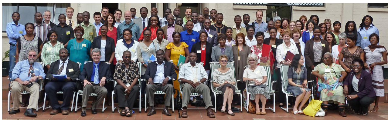
First annual MEPI partners' retreat in Harare, Zimbabwe, December 2011.

15 core faculty development workshops were conducted in 5 years, and 41 members of faculty had completed advanced training by 2015.