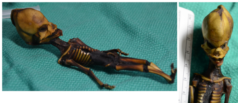
Figure 1. Mummified specimen from the Atacama region of Chile. Representative photograph of the 6-in skeleton (left) and frontal view of the skull of the Ata specimen (right).

genetic ancestry and sex determination, identification of disease- and phenotype-associated genes, and novel single nucleotide variation (SNV) detection.