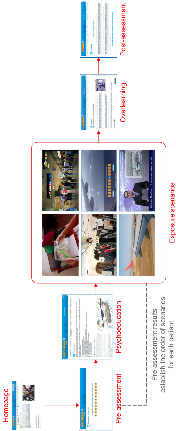
Figure 2 Navigation structure of the system.