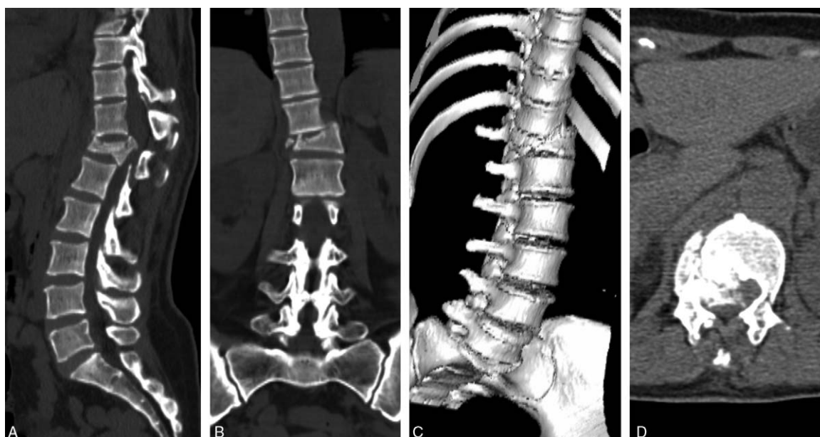
Figure 1. A 41-year-old male who suffered from T12 burst fracture–dislocation received emergency PRI surgery. (A) Sagittal CT image. (B) Coronal CT image. (C) 3D reconstruction of CT image. (D) Axial CT image.

Case 8: A 46-year-old female demonstrated complete paralysis caused by severe L1 burst fracture. Preoperative lower extremity muscle strength was grade 0. MIOM was initially attempted using SSEP, TcMEP, and TEMG, but TcMEP and TEMG could not be elicited. Ultimately, only SSEP was utilized. The SSEP amplitude decreased to approximately 50% of baseline when the investigators attempted to completely correct the fracture dislocation. The surgery was