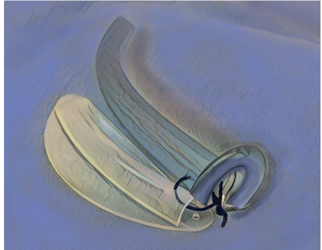
FIGURE 2: The Modified Double Barrel Technique. This combination of nasal trumpets and nasal splints allows for simultaneous placement of nasal trumpets in the presence of nasal splints. Trim away approximately one-third of the medial aspect of the outer flange of the nasal trumpets and use black suture to keep them together. Slide in the nasal trumpets and the nasal splints into the nasal cavity as a unit (starting with the tip of the nasal trumpets and then insert the nasal splints together with the trumpets as a unit). Note: make sure to place one longer nasal trumpet on one side and one shorter nasal trumpet on the opposite side.

3.3.2. Technique for Nasal Surgery Patients with Nasal Splints in Place (Modified Double Barrel Technique). If the patients just have had nasal surgery and have nasal splints sutured in place, then the nasal trumpets are placed lateral and inferior to the nasal splints using the Modified Double Barrel Technique, see Figure 2 for setup. For the Modified Double Barrel Technique, (1) decongest the nose with oxymetazoline (if the patient did not undergo inferior turbinoplasty surgery), (2) trim away approximately one-third of the medial aspect of outer flange of the nasal trumpets so that they can rest against the nasal splints (Figure 2), (3) use black nylon or black silk suture to keep the nasal trumpets attached to the nasal splints, so they sit in the proper position, (4) place a layer of mupirocin ointment on the nasal splints and on the nasal trumpets, (5) slide in the nasal trumpets and the nasal splints as a unit (starting with the tip of the nasal trumpets and then insert the nasal splints together with the trumpets as a unit) (note: make sure to place one longer nasal trumpet on one side and one shorter