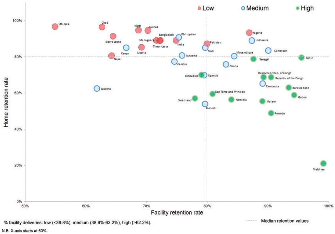
Figure 2. Ecological scatter graph of countries by home and facility retention rates between first and second deliveries, colour coded by percentages of all births in facilities