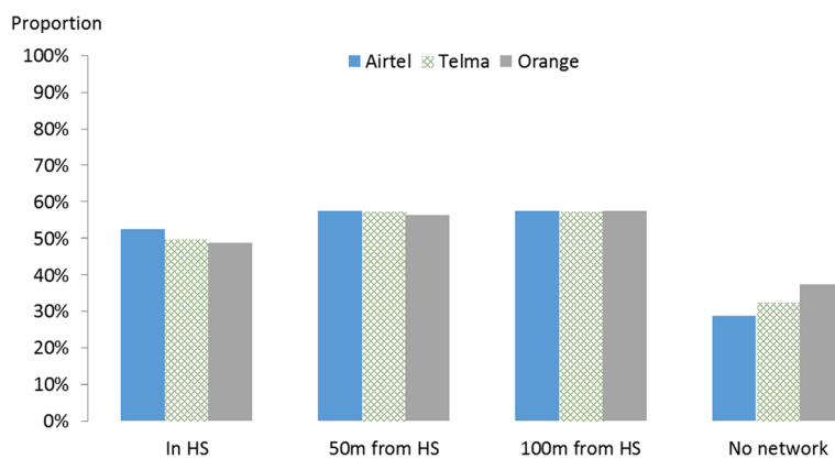
Fig. 2 Mobile phone network coverage at/around HS (N = 80), south and south-east, Madagascar, 2014. Bar chart illustrating the coverage by each of the three available mobile phone network providers within the HS and at 50 and 100 m distance

In order for disease surveillance systems to be effective, it is crucial they are simple to understand and perform [2]. In principle, electronic data transfer is supposed to