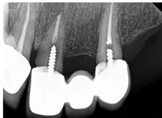
Fig. 3: Radiographic picture of a failed FDP as a result of failed posts.