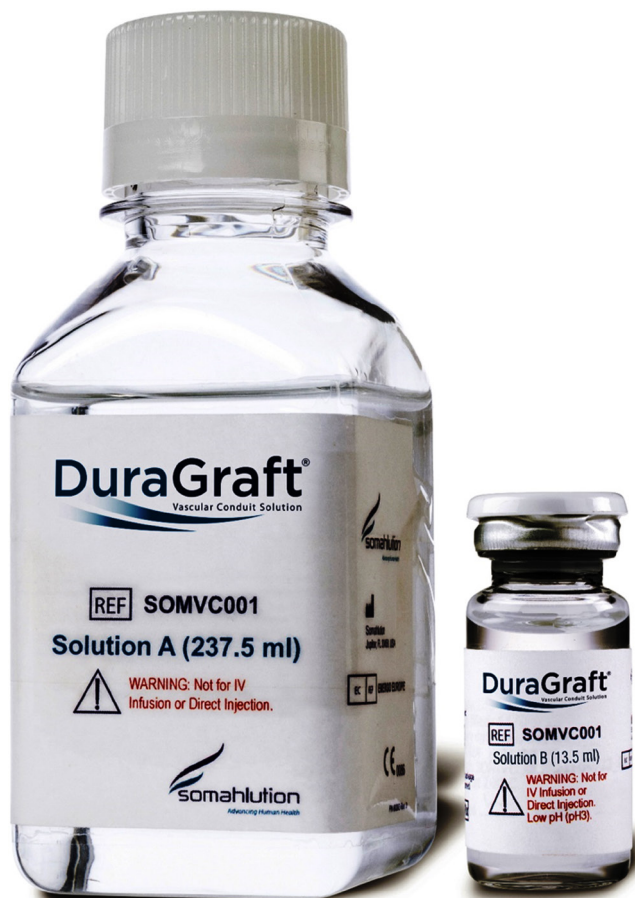
Figure 1 DuraGraft treatment solution.

will be conducted on all patients who withdraw or who are discontinued from the study.