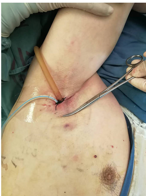
Figure 3 The incision of transaxillary uniportal VATS.

The drainage tube was removed 2 days post-operatively. The estimated volume of blood loss was 120 mL without blood transfusion. The surgical video of the procedure was recorded ( Figure 4 ).