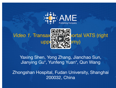
Figure 4 Transaxillary uniportal VATS (right upper lobectomy) (1). Available online: http://www.asvide.com/article/view/23856

Since 2011, growing number of uniportal lobectomies were performed throughout the world (2,3). Meanwhile, continuous modifications to the single-port procedure were made for the sake of improved clinical outcomes (4,5). Among the many efforts, different incision locations of uniportal VATS were most practiced: Liu and associates introduced subxiphoid uniportal VATS, to which the incision was switched from intercostal space to subxiphoid area (6). The procedure facilitated bilateral manipulation with fewer disturbances to the intercostal nerves, and