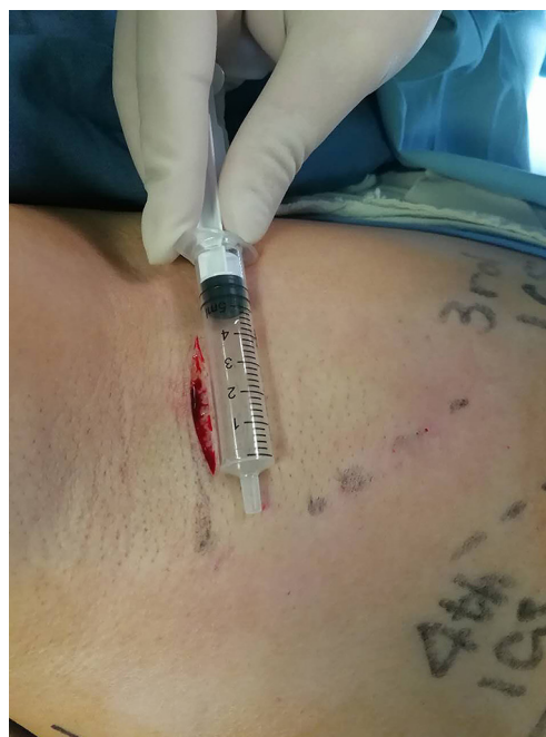
Figure 2 The incision of transaxillary uniportal VATS.

the operation. After the surgery, the patient was extubated at the end of surgery and transferred to the ward with patient-controlled analgesia (PCA) equipped.