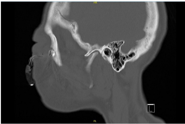
Fig. 5. CT image from one day after surgery showing the very close proximity of the zygomatic implant tip to the lateral orbit, sagittal view.

procedure, active drainage of blood from within the orbit was observed. When spontaneous draining was completed, two Penrose drains were inserted and left in place: one on the orbital floor and one on the lateral side of the zygoma. Methylprednisolone 40 mg (four times a day) was administered, and acetazolamide 500 mg was added after an ophthalmological consult several hours later.