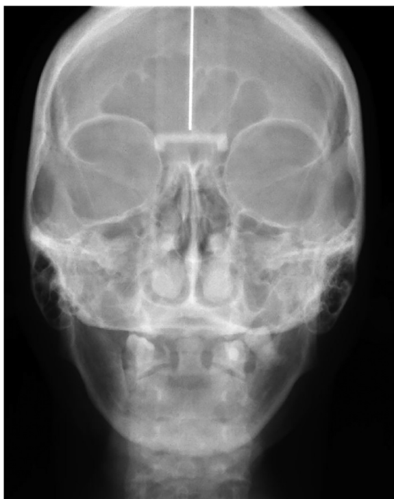
Fig. 1. PA radiograph pre-treatment. Note that there are no abnormalities of the orbits.