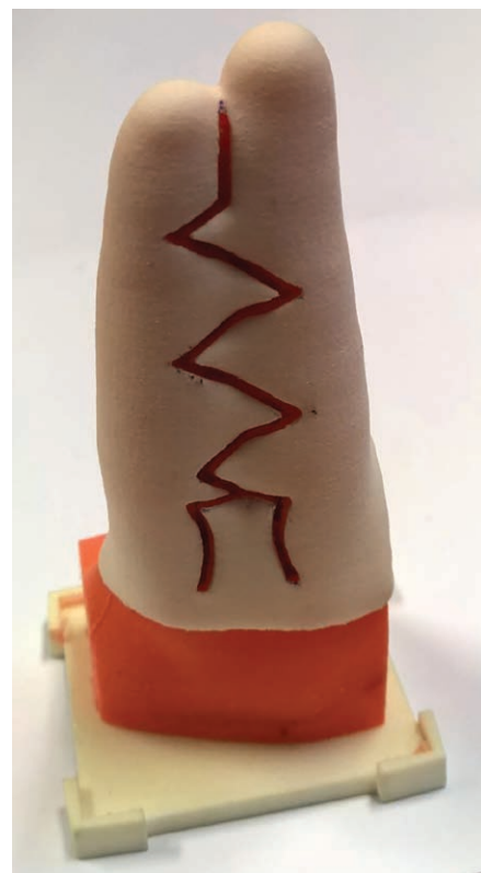
Fig. 3. Template fitted to the silicon syndactyly model. The custom-made template was placed onto a silicon syndactyly model. Thereafter, the planning could be marked with a marker pen.