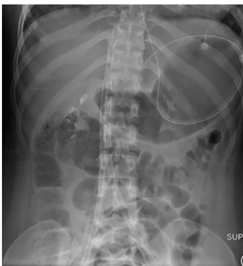
Figure 2 Abdominal X-ray showing the longer course of the left-sided femoral cannula.

cannula capable of being passed. For example: