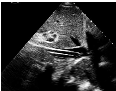
Figure 4 Ultrasound-guided positioning of the return cannula in the IVC. IVC, inferior vena cava.

of the heart. We also intermittently check the position of the wires throughout the procedure to confirm there has been no wire migration. In difficult cases, such as tortuous vessel or repeated kinking of the wire, we may employ stiffer wires (such as an Amplatz Super Stiff™ Guidewire, Boston Scientific, USA). However, this requires careful monitoring to ensure the wires do not migrate inwards as the risks of internal damage are higher with a stiffer, straight tipped wire.