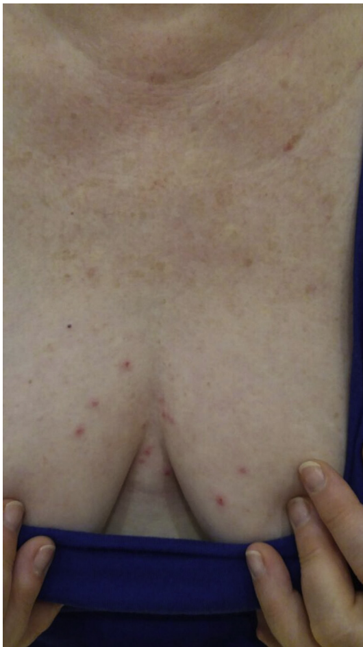
FIG. 1. Skin eruptions caused by Dermanyssus gallinae (poultry red mite) bites in 54-year-old woman.

presence of Bartonella quintana in Dermanyssus sp. mites during an outbreak of trench fever in the Czech Republic [12].