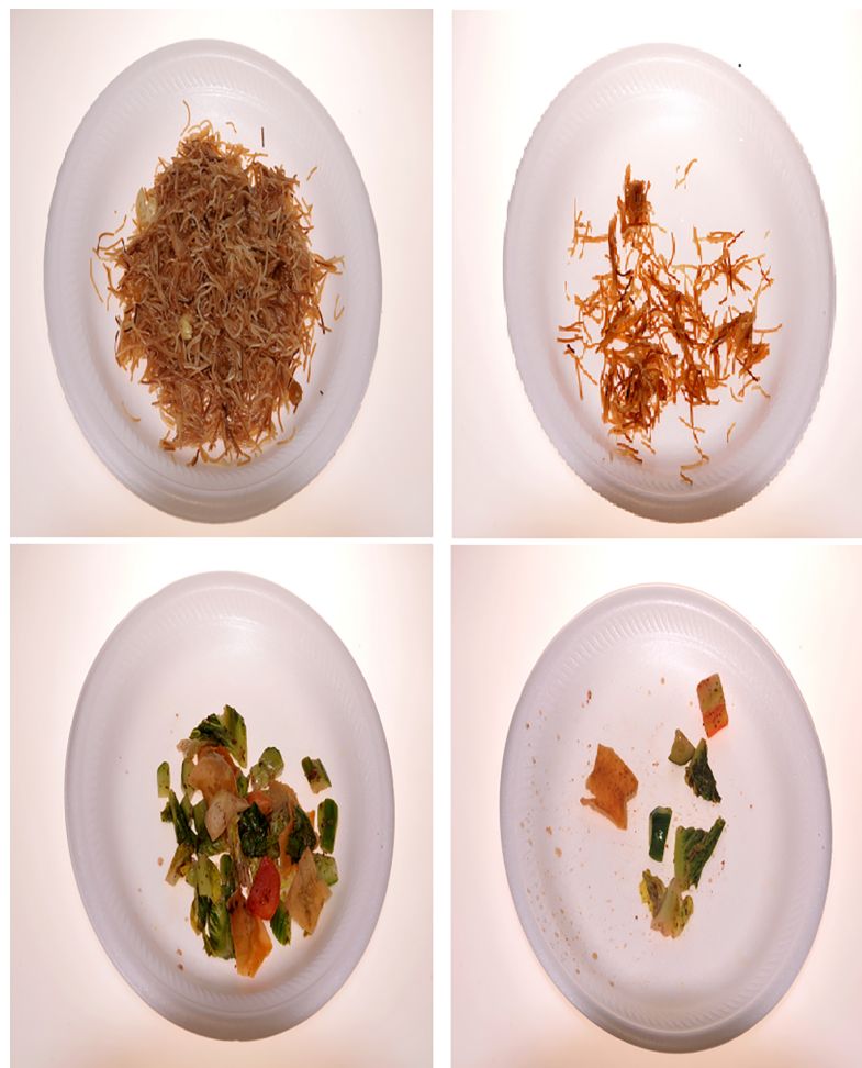
Fig 1. Examples of amounts of food before consumption and leftovers of the same meal. Amounts before consumption left, leftovers right.

https://doi.org/10.1371/journal.pone.0196389.g001